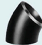
45° Elbow (long)