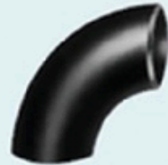
90° Elbow (long)

They are accepted worldwide for their excellence in quality, reliability and their compromising services to each of their customers over many countries in the world.