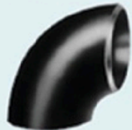
90° Elbow (Short)